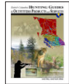
BC Hunting Guides & Outfitters BC hunting guides, outfitters, products & services.

Here's a sample listing from one of our catalogs . . .