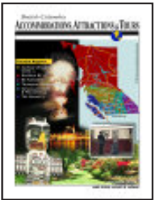
BC Vacations, Accommodations, Attractions & Tours. Places to stay. Things to see & do.