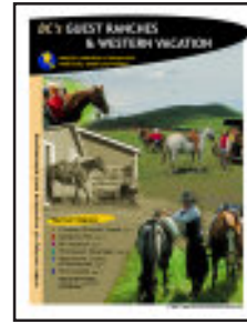
Guest Ranch & Western Vacations Ranches, horseback riding, cattle drives, pack trips etc.