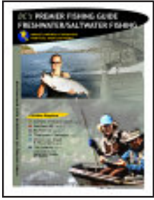
BC's Premier Fishing Guide Fresh & saltwater resorts, lodges, camps & guides.

Meet our family of BC Vacation Catalogs . . . Place your ad in more than one catalog and save! We offer volume pricing.