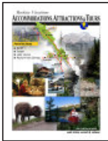
The Rockies Vacation Guide Vacations, Accommodation, Attractions & Tours in the Rockies.