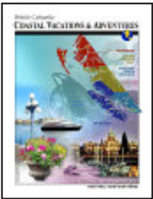
Coastal Vacations & Adventures West Coast resorts, getaways, vacations, trips & adventures.