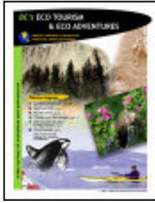
Eco-Tourism & Adventures Nature based & eco-friendly vacations & adventures.