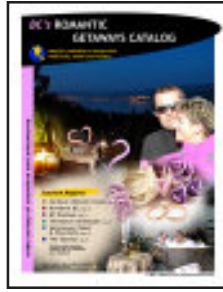
BC's Romantic Getaways Unique romantic getaways & honeymoon destinations.