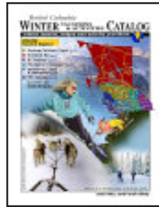
BC Winter Vacations & Activities BC's four season resorts & outdoor winter fun.